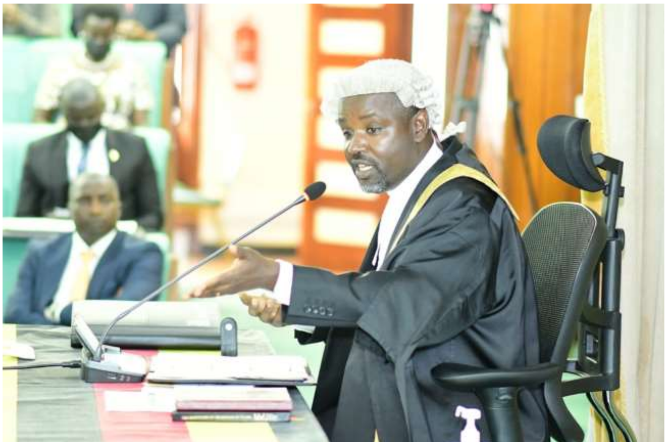
Figure1: Rt Hon Tayebwa Thomas during one of the Ugandan parliamentary sessions

Uganda has the highest rates on taxes in whole of the East African Community and this highly affects employees' salaries which makes them lose almost 50% of their salaries through government taxation