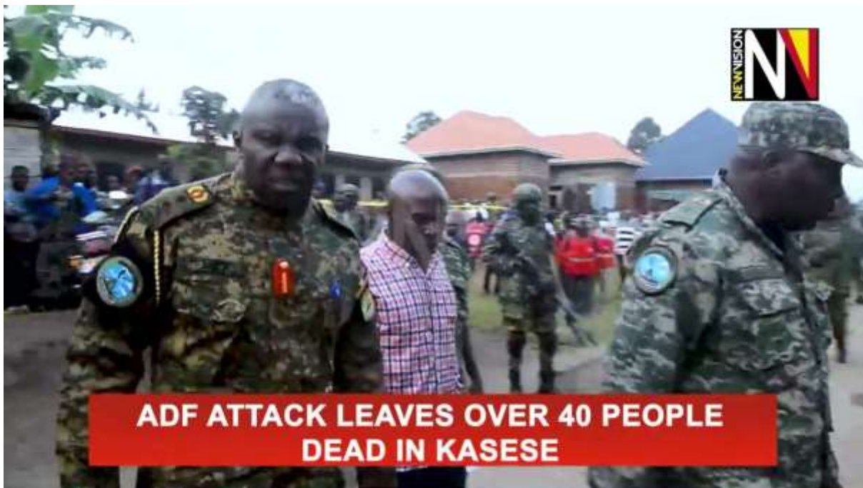
Figure1: Uganda Army leaders in West Uganda and East parts of Congo

Ugandan Parliament Deputy Speaker on rates of taxes of the civil servants